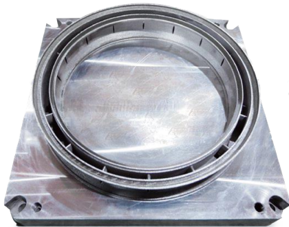
Engine leaf ring structure 316L φ 400 X 60 mm