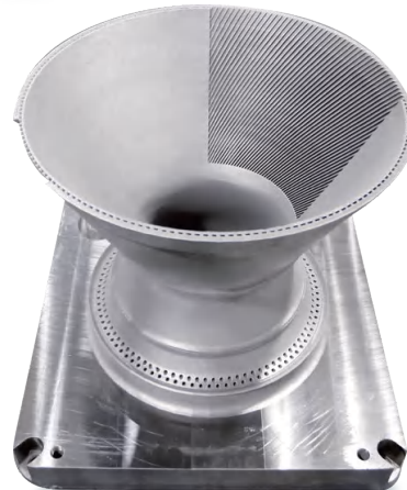
TC4 titanium alloy φ 393 X 340 mm