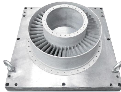
Engine turbine casing assembly IN718 φ 410 X 240 mm